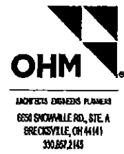
FIGURE: 2 of 2

SITE LOCATION HURON PIER LADDER REPLACEMENT / REPAIR CITY OF HURON